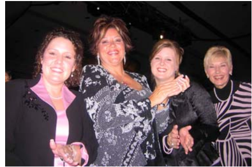
New friends from Texas

The Leadership Conf. was a wonderful event that I think each member of ABWA should try to experience! It was a time to get to know my chapter members better and create a more personal relationship with them. I also met people from other chapters; women from Charlotte, N.C., Yuma, AZ, Colorado Springs, CO and many other places in