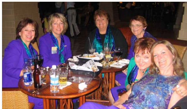
Soaring Eagles talking North County strategy

A few things I plan to suggest to the 2006 Convention Committee include better handling of the expo center, more signage to promote the 2007 Convention, and more information at the newcomers' orientation session. In addition, we need to consider the trouble and expense of the participants' shipping large baskets home if they are successful in the opportunity drawings – maybe gift cards or other ideas would work better. In addition to the District VI meeting, some more casual social gatherings during the conference would be very enjoyable. As a sponsoring chapter, the Soaring Eagles will have the opportunity to have a voice in making our conference the best it can be!