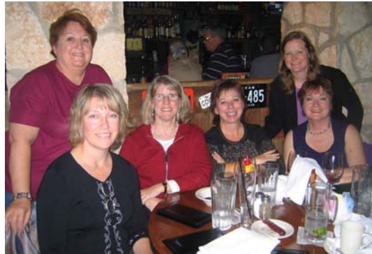
Soaring Eagles enjoying dinner in a real Texas Steakhouse!