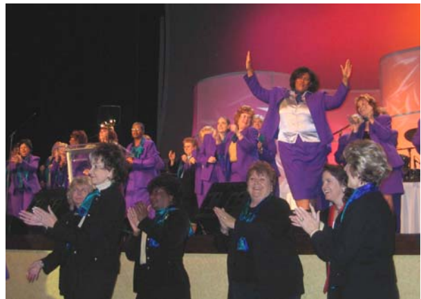
2006 Convention Supporters dancing to "Lovely Days"

officer installation, dinner and a live band. We even made a trip up to the stage as part of advertising the 2006 Convention! It made you proud to be a businesswoman today. What a blast! Since our chapter is so supportive and wants members to expand their horizons, I really hope that more members try to make it to one of these superb events. It was well worth it!