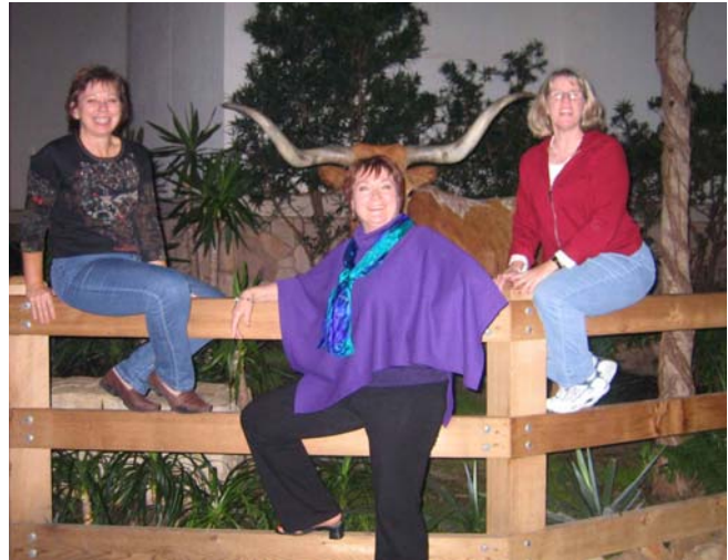
California girls wanna be cowgirls, ya'll!