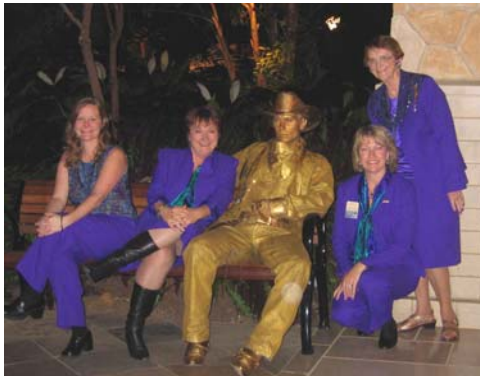
They do everything "golden" in Texas!

I also went to several keynote addresses, but I believe I enjoyed Carole Keeton Strayhorn the most. Given that she is running for Governor of Texas, the speech was political, but she was funny, smart and well spoken. Despite all her achievements: first Mayor of Austin, first woman in history elected Texas Comptroller, etc., her priorities were similar to mine. She said the top priority in her life was her grandchildren and then the Governorship. Yeah! I can really get into that.